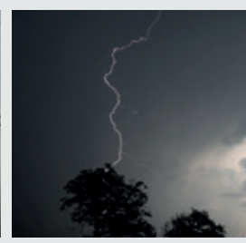
Storms & Wind