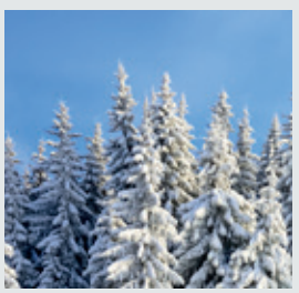
Cold, Snow and Ice